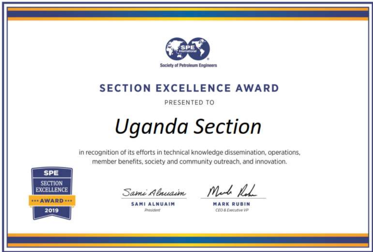
SPE Uganda Award for section excellence

The Society of Petroleum Engineers for the Uganda section won an international award for section excellence. This award is presented to only 20% of the 203 SPE sections in the world. The award is in recognition of the SPE Uganda's exceptional efforts in technical knowledge dissemination, operations, member benefits, society and community outreach and innovation.